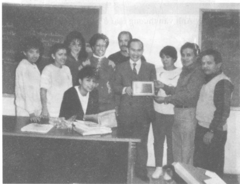
Dạy Anh Văn giao tiếp ở thành phố New York, 1989

Tựa Bài & Tác Giả Tân Nhạc Việt Nam (sưu tầm)