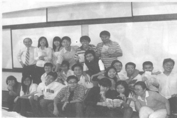
Dạy Anh văn ở Đại Học Quốc Tế, Thủ Đức, 2009