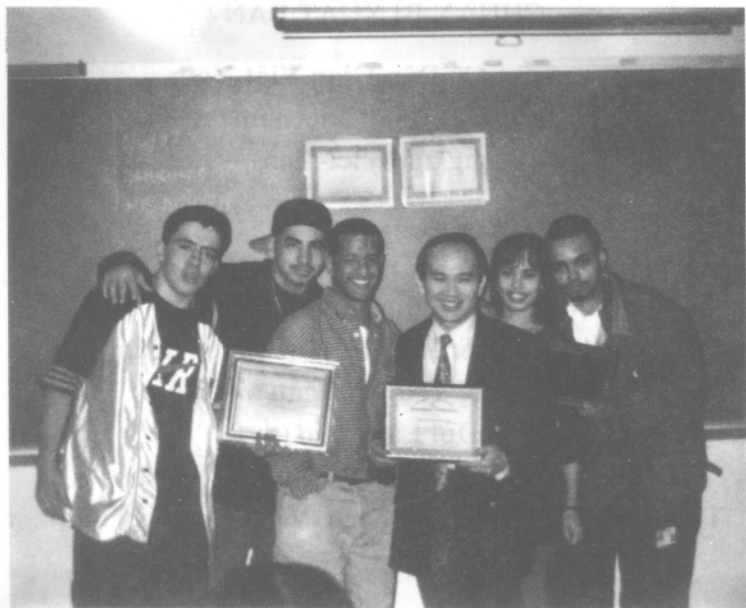
Dạy Anh văn thương mại ở New Jersey , 1977